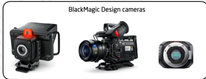
BlackMagic Design cameras